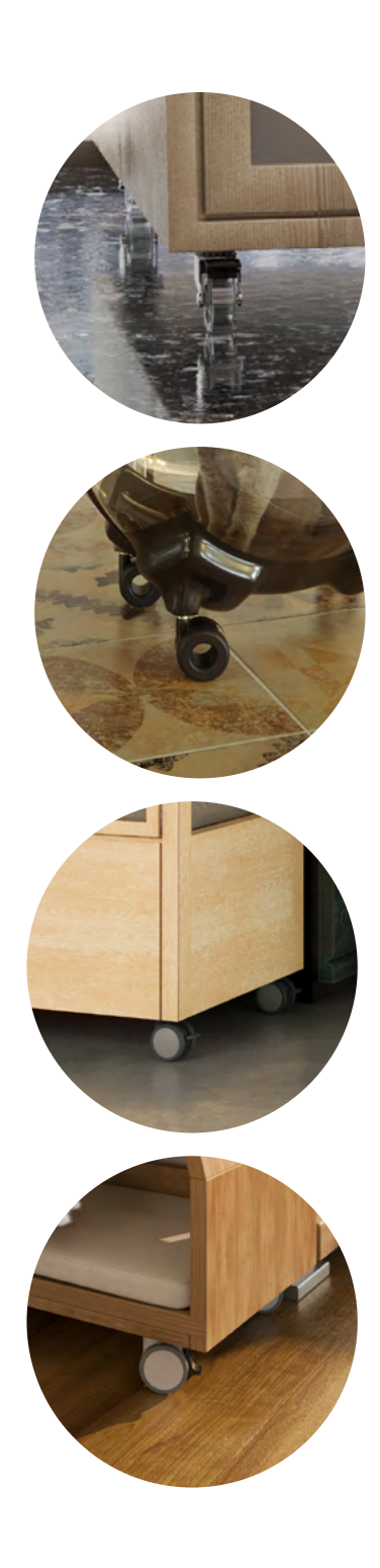
凭着独特的工艺和设计 改变世界对中国 产品的不良印象